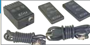
Remote Control and 3-Way Wall Switch (IR + RF Remote)