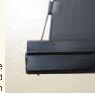
Detail of Adjustable Tension Cord and Connection