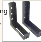
Optional 6" L Bracket