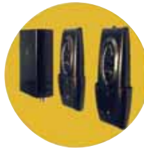
Standard IR & RF Remotes with Wall kit