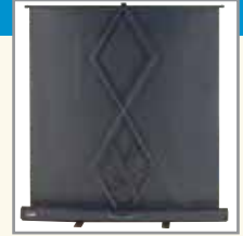
Portable Type Projector Screen Comparison Chart