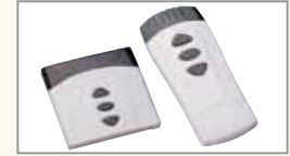
Optional Extended Brackets Standard Hanging Brackets Standard IR Remote & Wall Switch