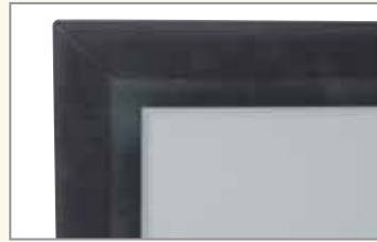
Velvet Aluminum Screen