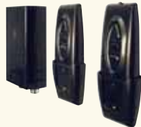
Standard IR & RF Remotes Included