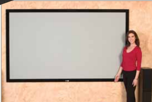
High Contrast Gray Screen Material